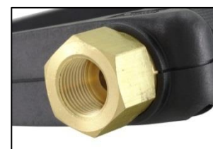
3/8" female thread